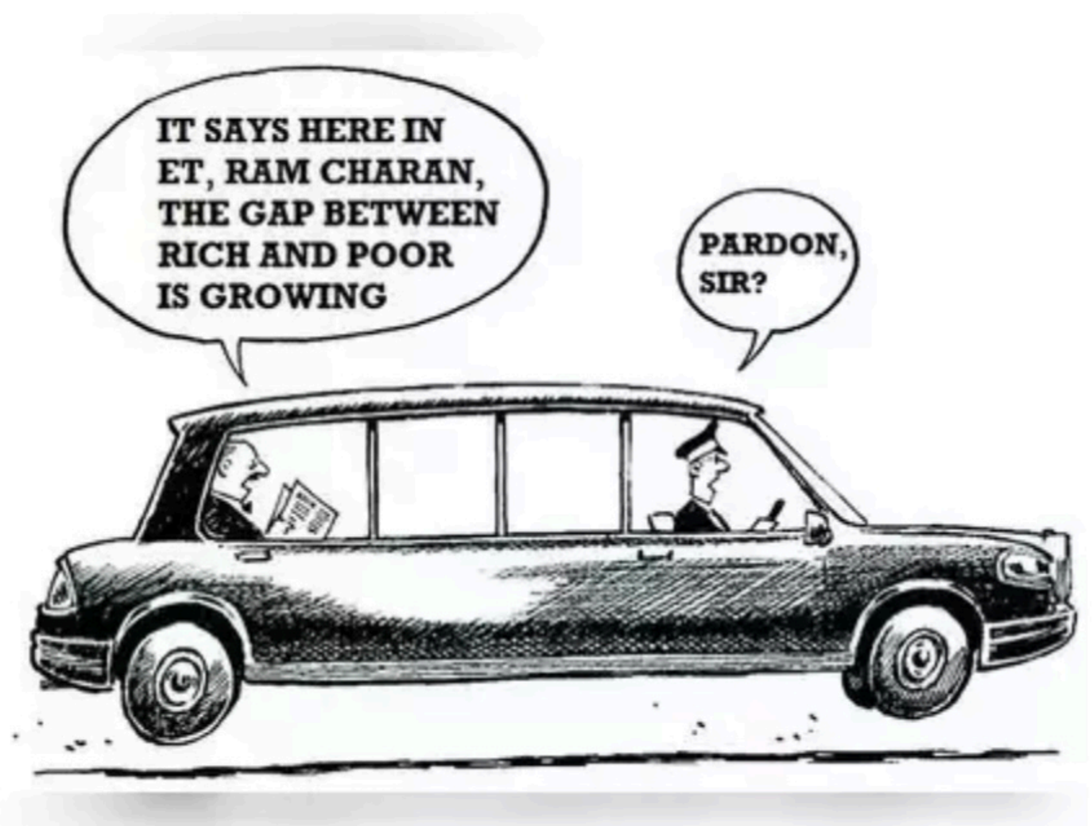
Social distancing via economics